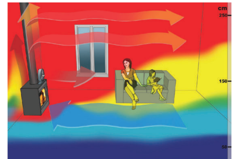
Air circulation with SIROCCO

P.S. With adjustable screw legs SIROCCO can be used on uneven surface or oblique stoves.